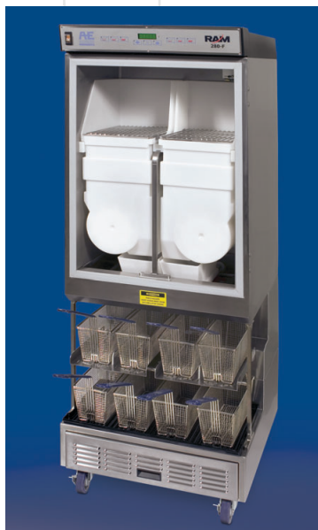
Shown with door removed

Only 28 inches / 72 centimeters wide 48 lbs. / 22 kg. Hopper Capacity (Fry Baskets Sold Separately)